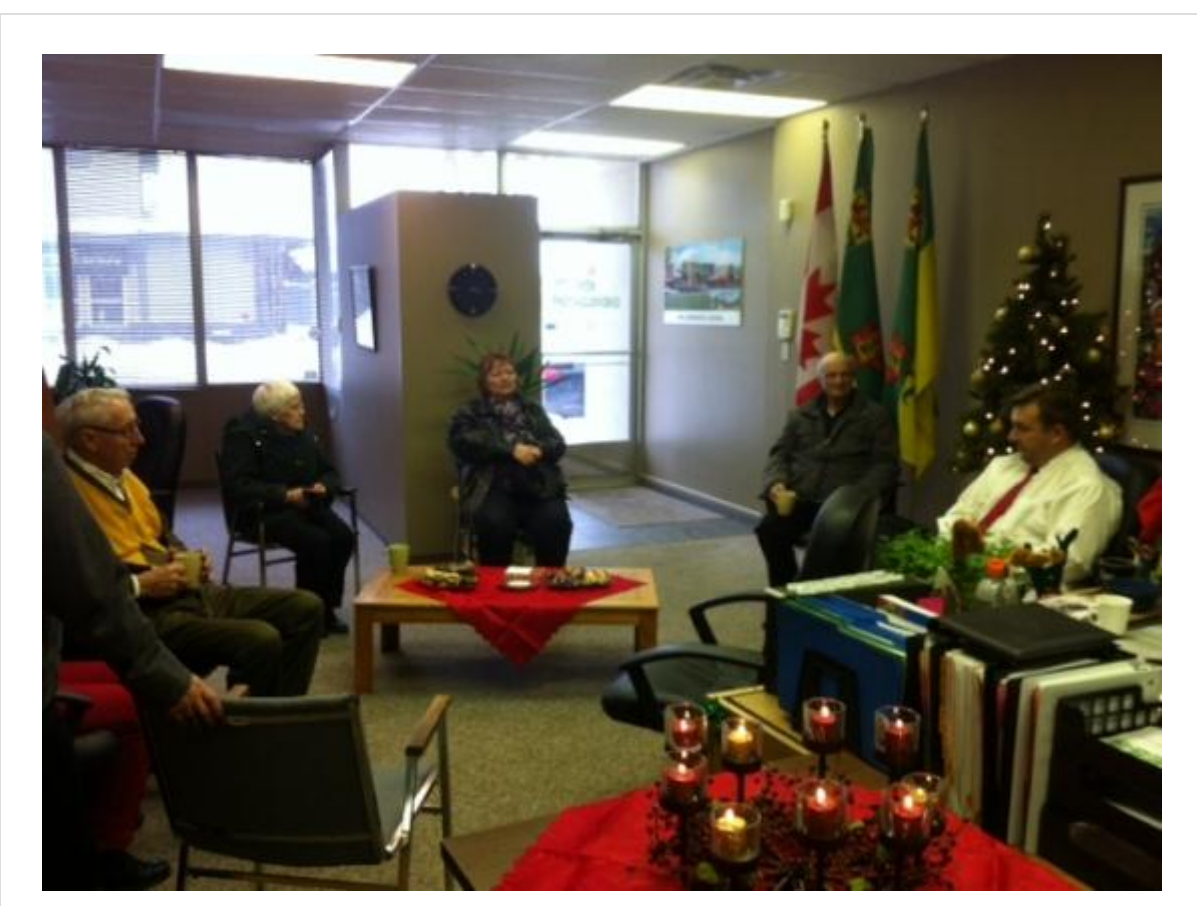
Christmas Coffee Connection