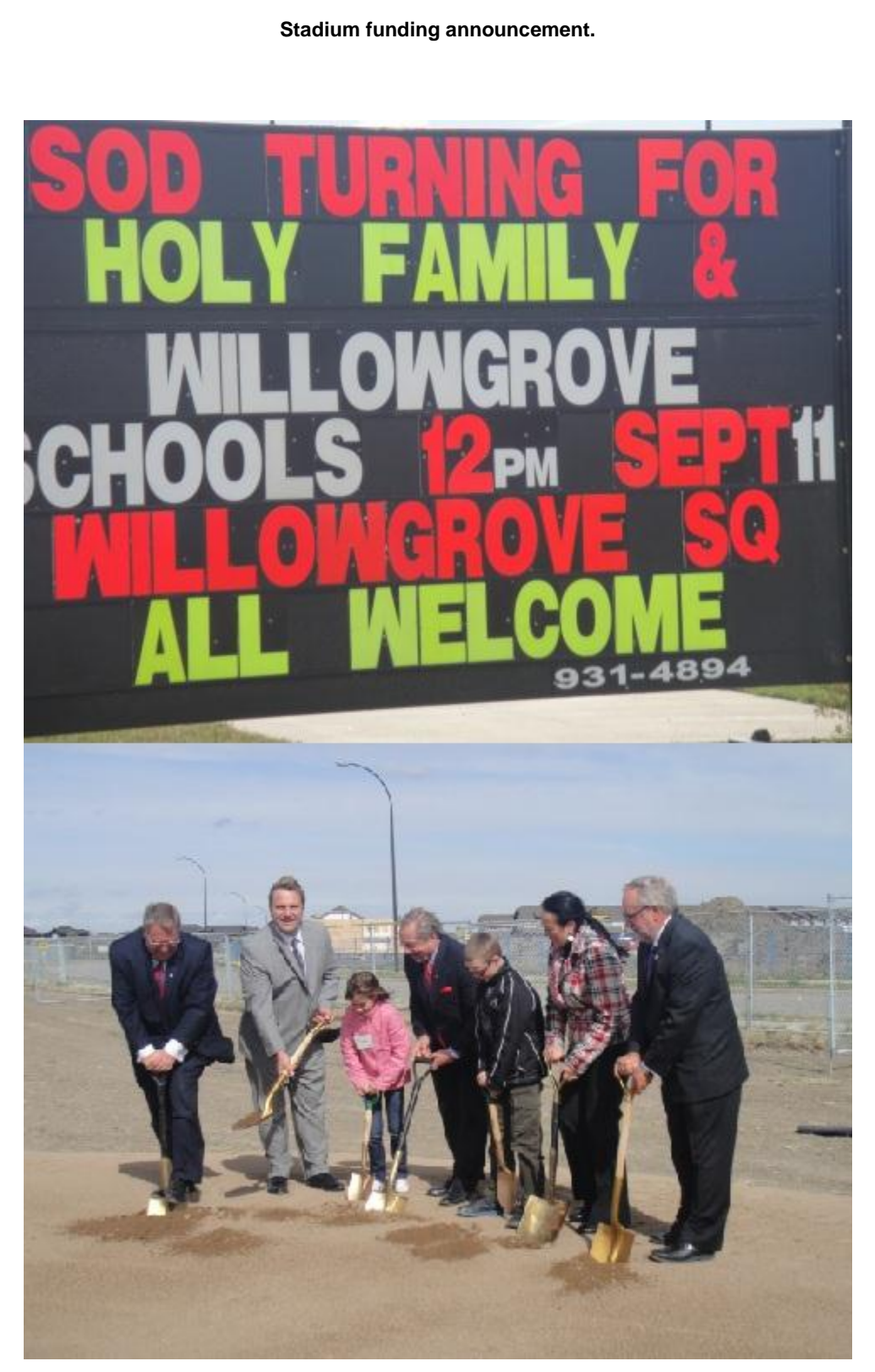
Sod turning of the new Willowgrove School Project.