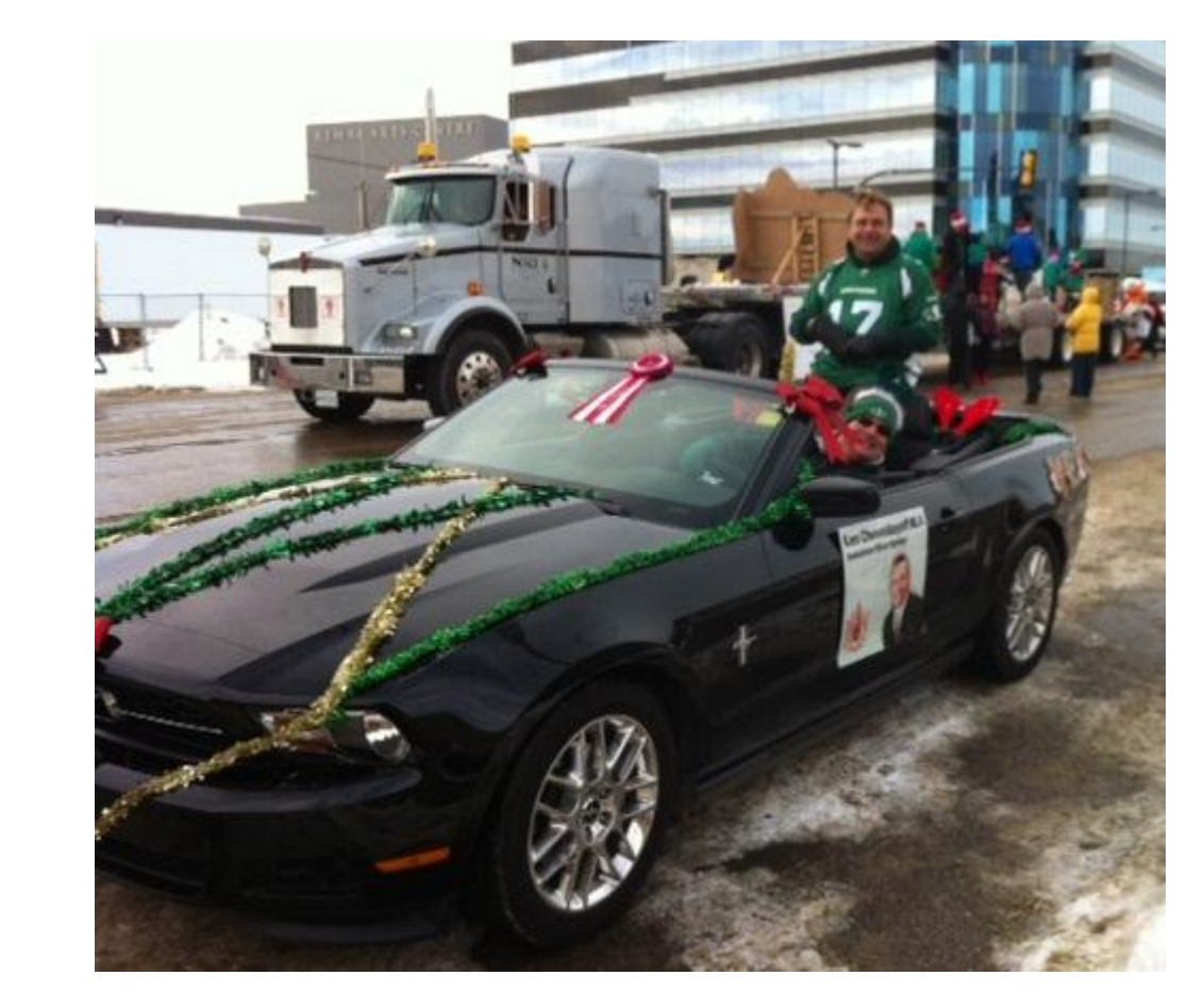
Santa Claus Parade 2012